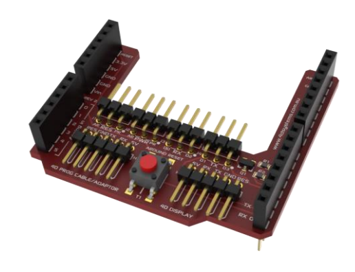
4D Arduino Adaptor Shield

For a detailed listing of the capabilities of the display module in this Arduino Pack, please refer to the datasheet for the display itself, available from the 4D Systems website, www.4dsystems.com.au.