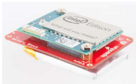
Battery Block Installed

The Battery Block is very simple to use. You can mount the Edison module securely using our Hardware Pack. Note: It may be necessary to gently remove the battery to allow clearance for screws. It's only necessary to do this if the Battery Block is the only Block in a stack.