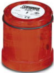
Flashing beacon element, 24 V DC, red, Xenon flash tube

Please be informed that the data shown in this PDF Document is generated from our Online Catalog. Please find the complete data in the user's documentation. Our General Terms of Use for Downloads are valid ( http://phoenixcontact.com/download )