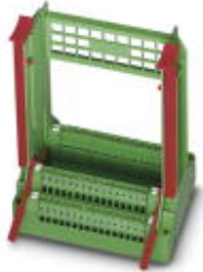
Plug-in card block, Nominal current: 4 A, Number of positions: 64, Pitch: 0 mm, Connection method: Screw connection, Color: green

Please be informed that the data shown in this PDF Document is generated from our Online Catalog. Please find the complete data in the user's documentation. Our General Terms of Use for Downloads are valid ( http://download.phoenixcontact.com )