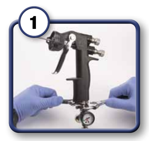
Hand tighten or use two wrenches to connect the air flow control value.