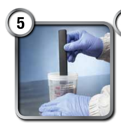
Mix product as needed.