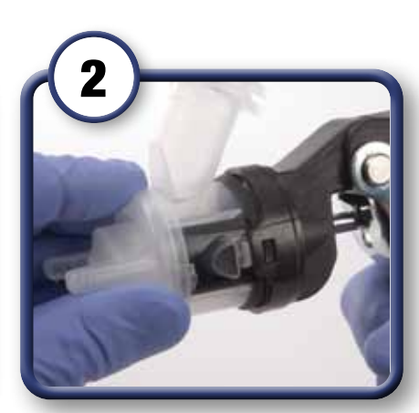
Attach an atomizing head to the gun - pull trigger back and hold, making sure the release buttons are aligned with latch openings - listen for a double click to ensure that it is fully engaged.