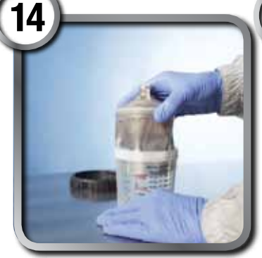
When you're done using the system, the lid and liner can easily be removed from the cup.