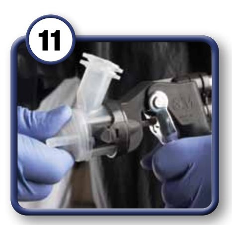
Re-attach the same atomizing head or when necessary replace with a new one.