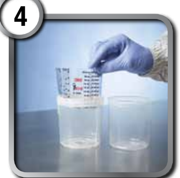
If not using a scale to measure, insert 3M<sup>™</sup> PPS<sup>™</sup> mix ratio film into cup before inserting liner in order to measure the paint according to paint manufacturer's quidelines.