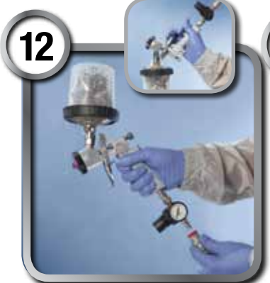
To return material back into gun cup before disconnecting spray gun, disconnect air line, invert gun (gravity feed only) and pull trigger fully for a few seconds.