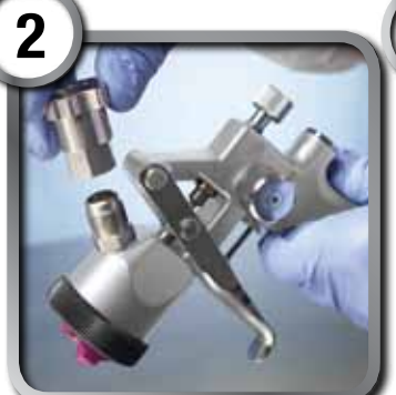
Thread correct adapter to spray gun.