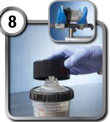
3M<sup>™</sup> PPS<sup>™</sup> shaker core is used to distribute clamping force when shaker machines are used to mix material.