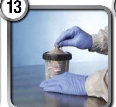
Remaining material can be capped and stored for later use. Storage of paint should follow all local regulations.