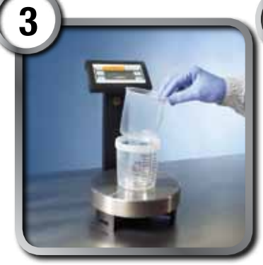
Remove liner from wall dispenser and place into 3M<sup>™</sup> PPS<sup>™</sup> mixing cup. Weigh the paint according to paint manufacturer's guidelines.