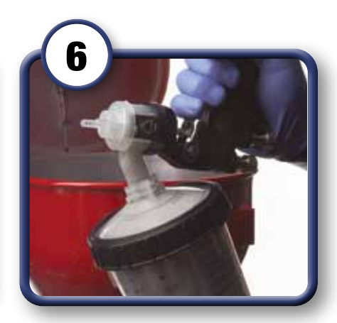
When you are finished using the system remove the air line and 3M^{TM} PPS^{TM} Cup .