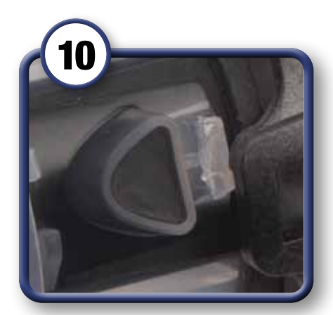
Inspect atomizing head for damage or wear which could result in fluid leaks or poor performance.