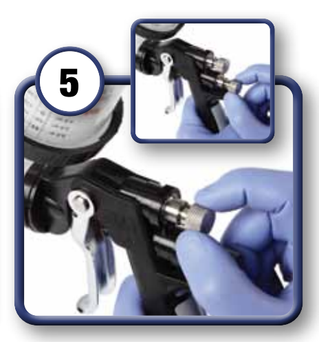
Adjust fan and fluid flow to achieve the desired size and wetness of the pattern. NOTE : when closing the fan adjustment completely it may be necessary to re-adjust the air flow control valve.