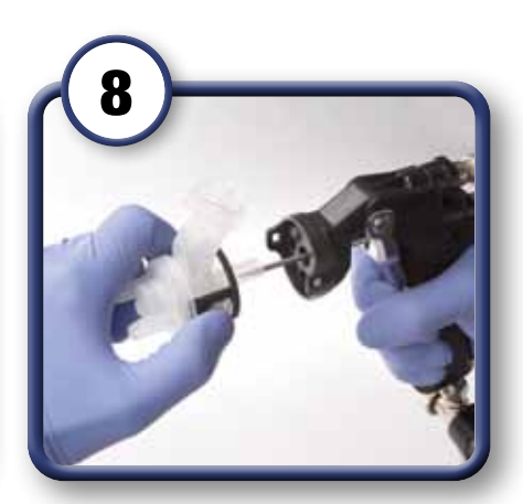
Remove atomizing head - be sure to pull trigger back and pull the atomizing head straight out from the gun body to avoid bending the fluid needle.