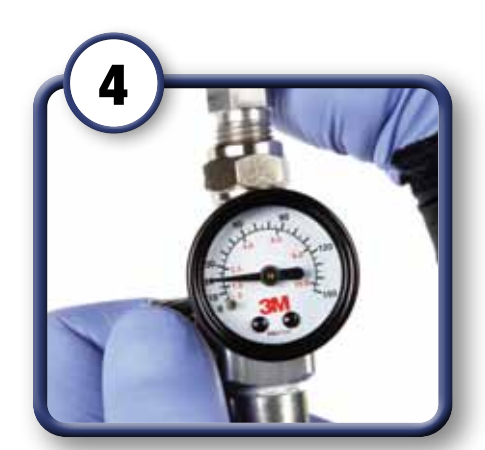
Set air pressure at 20 psi at full trigger (air and fluid flowing).