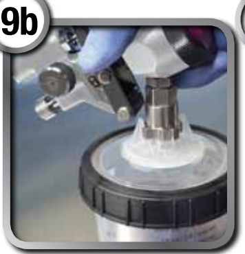
Make sure that the lid fingers are fully engaged above adapter edge.