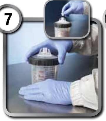
Position locking collar onto the 3M<sup>™</sup> PPS<sup>™</sup> cup/liner and turn until tight. Insert sealing plug prior to shaking.