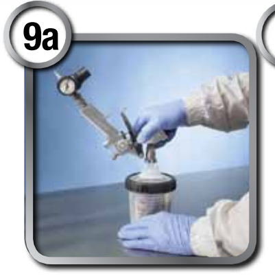
Spray gun with correct adapter is attached with a quick quarter turn.