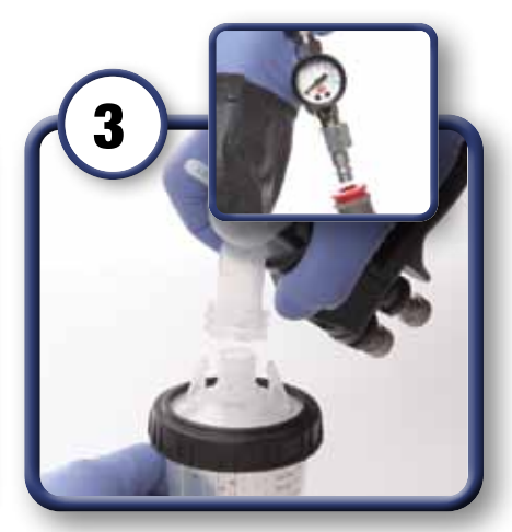
Attach 3M<sup>™</sup> PPS<sup>™</sup> cup filled with coating and attach compressed air hose.