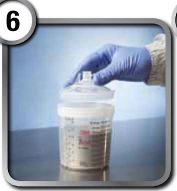
Take a lid (with built-in filter) from wall dispenser and snap into the 3M^{TM} PPS<sup>TM</sup> cup/liner.