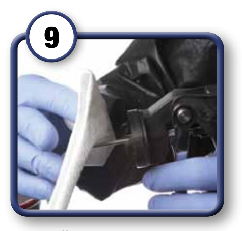
Wipe off any additional residue from the fluid needle.