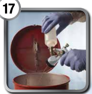
A squeeze bottle (PN 37720) containing solvent or water enables fast gun cleaning once the 3M<sup>™</sup> PPS<sup>™</sup> cup is removed. More efficient painters make facility more productive.