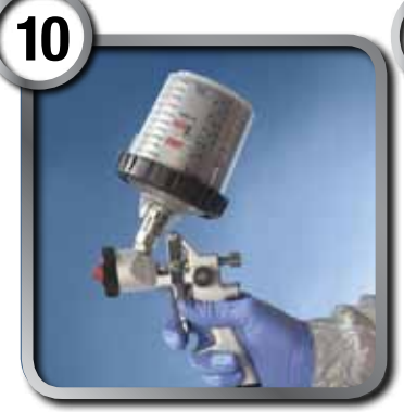
The spray gun is now ready to spray as normal. NOTE: For spraying upside-down, follow directions in the "Tips" section on purging air.