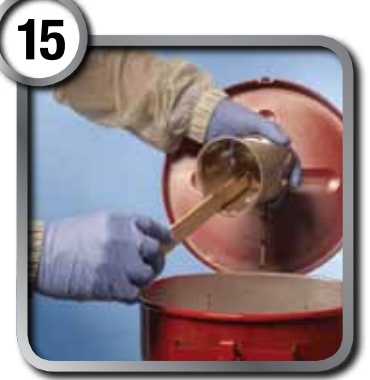
Remove unused material from the liner and place into proper disposal container.